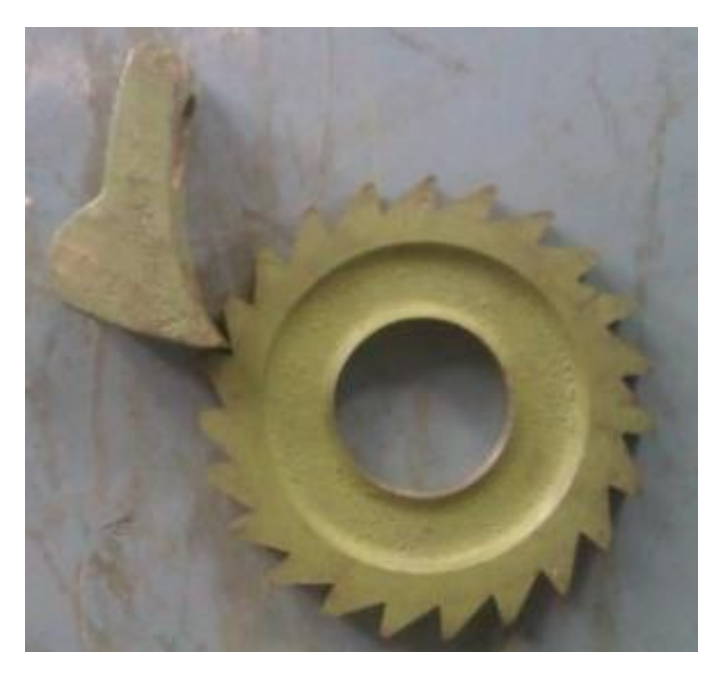
Fig. 3: Fabricated Ratchet and Pawl mechanism

Grey cast iron and C45 respectively. Both surfaced are considered to be hardened. The number of teeth on ratchet wheel is assumed as 12. The following parameters are considered for the design of the mechanism. The three dimensional model of the mechanism is shown in Figure 2.