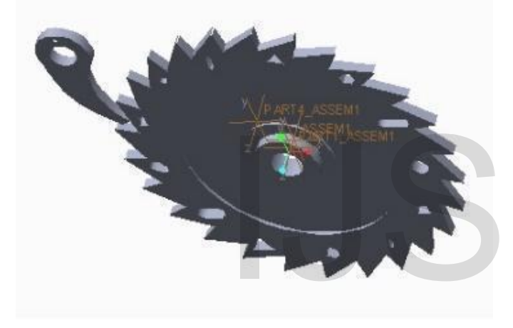
Fig. 2: Three dimensional model of Ratchet and Pawl mechanism